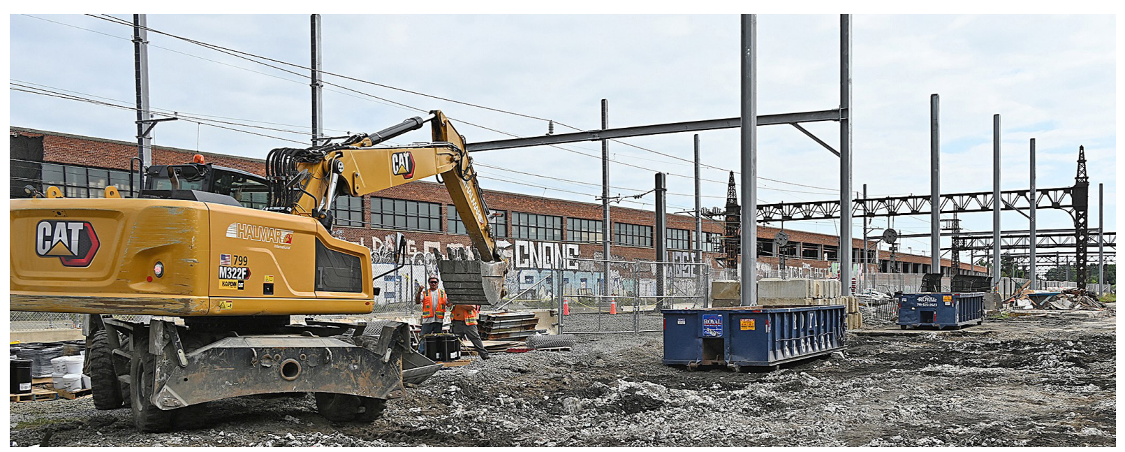
PSA crews progress site preparations at site of future Parkchester/Van Nest Station, August 2024

Work is ramping up at the site of the future Parkchester/Van Nest Station. Concrete foundation work, including walls, pile caps, grade beams, and elevator foundations, is ongoing and expected to be completed by the end of the year. Crews will also continue to progress drainage, caissons, and signal work north of Track 1 near the station site. The next phase of work at this location includes utility installation and pouring the concrete slab for the station entrance. Later in 2025, crews will commence steel erection and begin work on the station house walls. At Leggett Interlocking, signal, communication, and testing are underway with commissioning planned for the coming months.